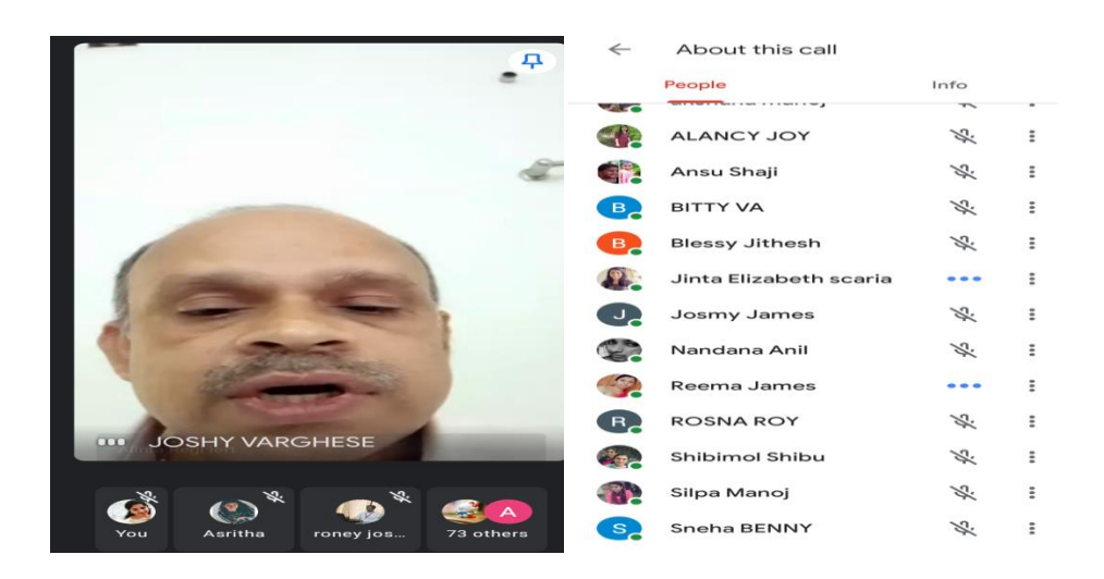
List of Participants